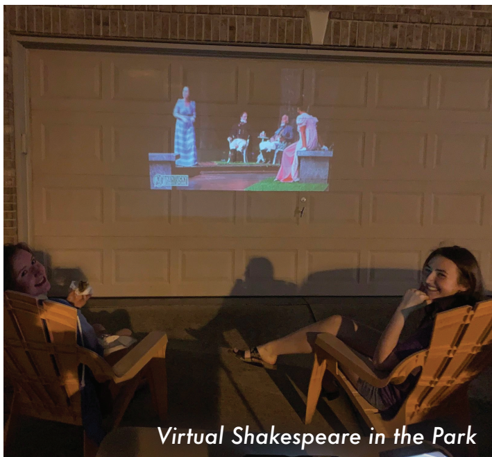
Virtual Shakespeare in the Park