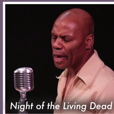
Night of the Living Dead