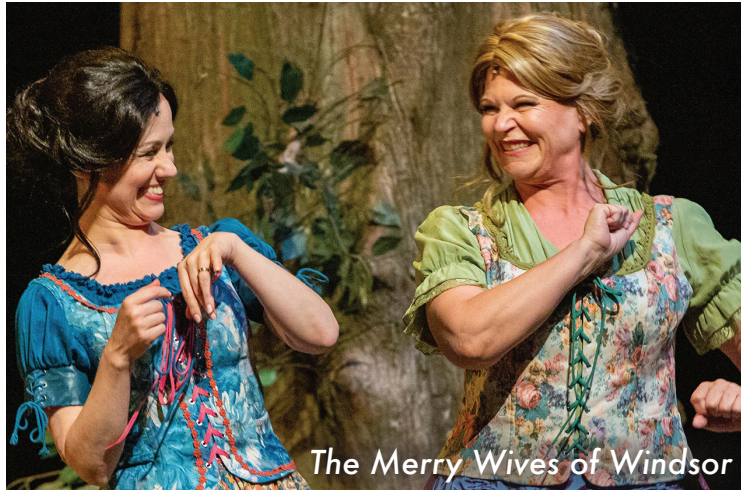
The Merry Wives of Windsor