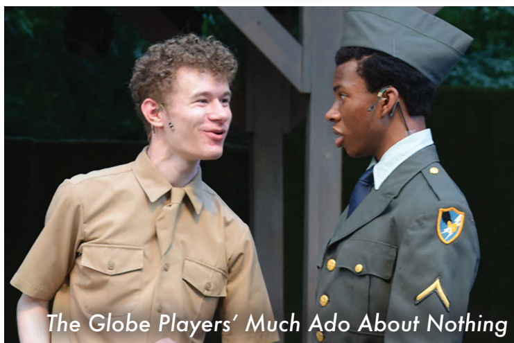
The Globe Players' Much Ado About Nothing