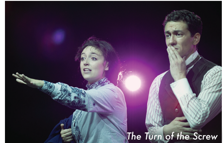
The Turn of the Screw