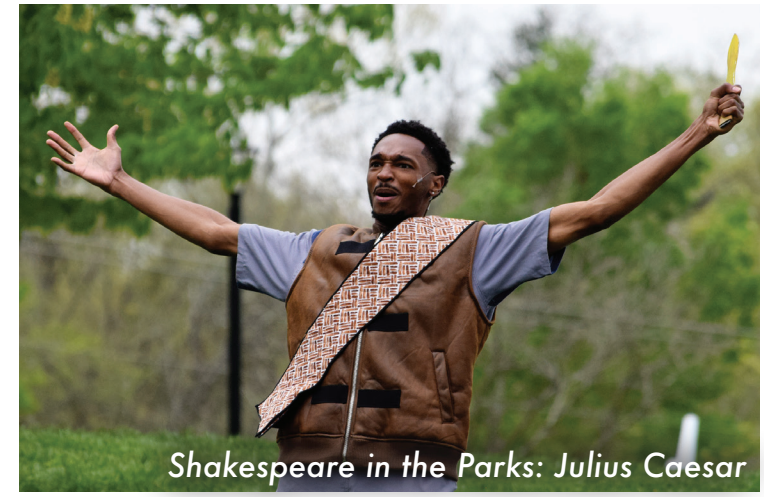
Shakespeare in the Parks: Julius Caesar