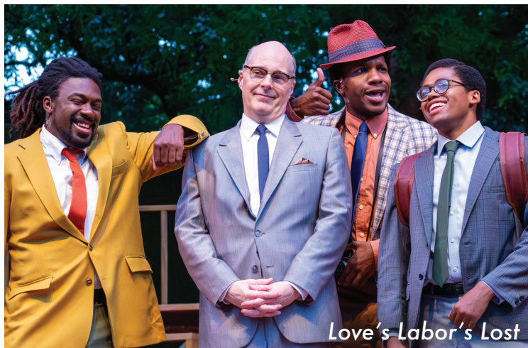
Love's Labor's Lost