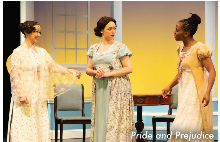
Pride and Prejudice