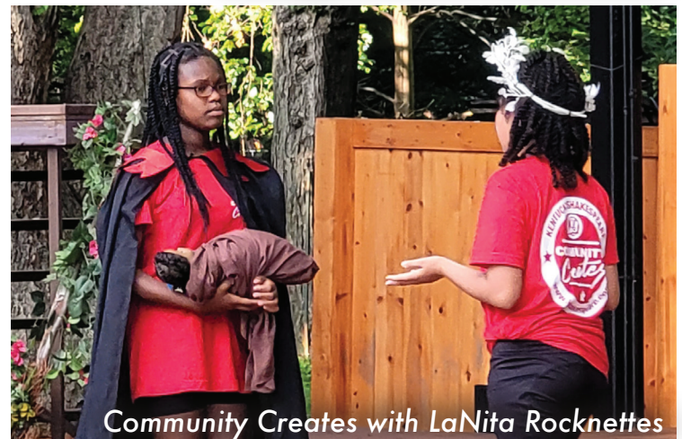
Community Creates with LaNita Rocknettes