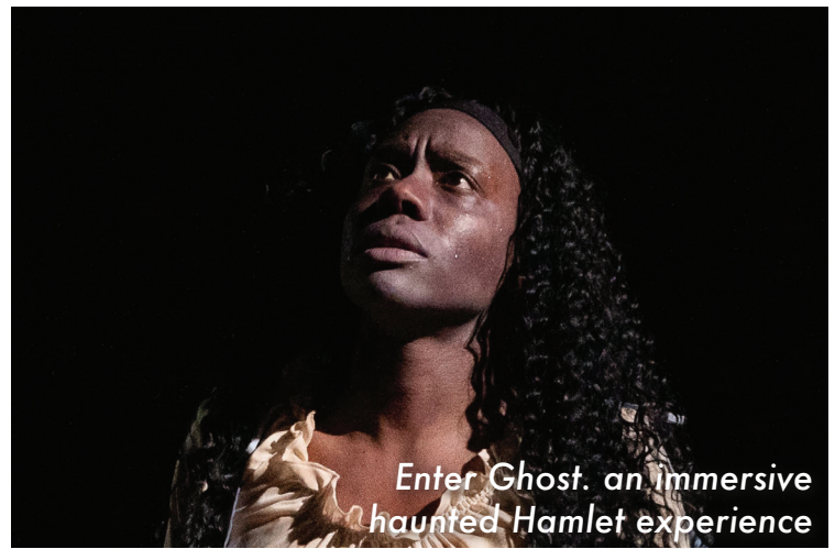
Enter Ghost. an Immersive haunted Hamlet experience