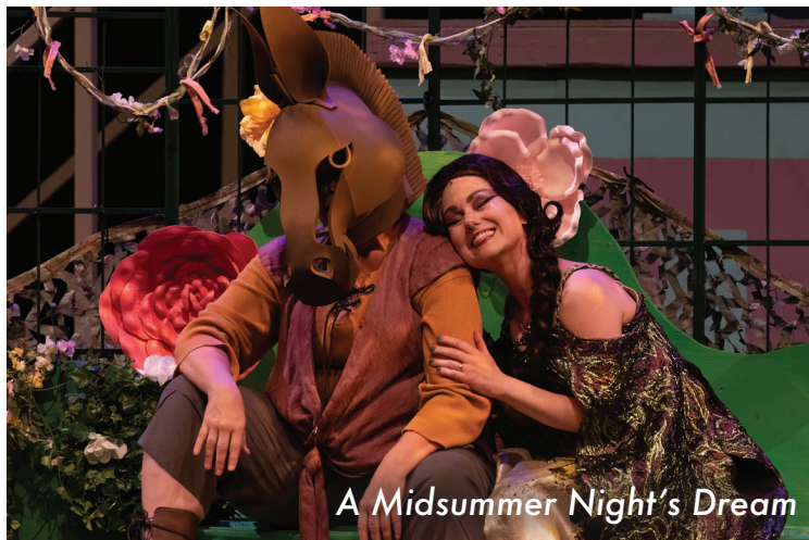
A Midsummer Night's Dream