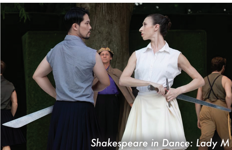
Shakespeare in Dance: Lady M