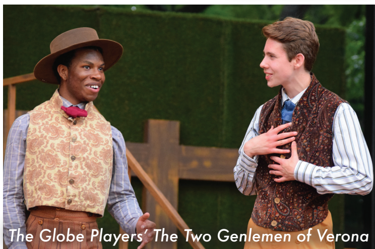
The Globe Players' The Two Gentlemen of Verona