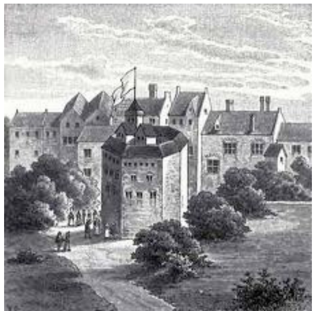
The Original Globe Theatre circa 1612